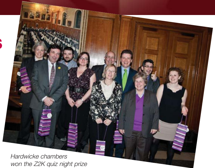
Hardwicke chambers won the Z2K quiz night prize (Sandi Toksvig is third from right)

We improved our finances with a very successful fundraising quiz night hosted once again by Sandi Toksvig, one of our wonderfully supportive patrons. It was at Inner Temple where teams of solicitors and barristers battled it out over one ferociously difficult round: album covers rendered in Lego. This year we organised the event jointly with the Bar Pro Bono Unit, who do great work in procuring free advice from barristers for those in need, and Z2K will be sharing the proceeds with them.